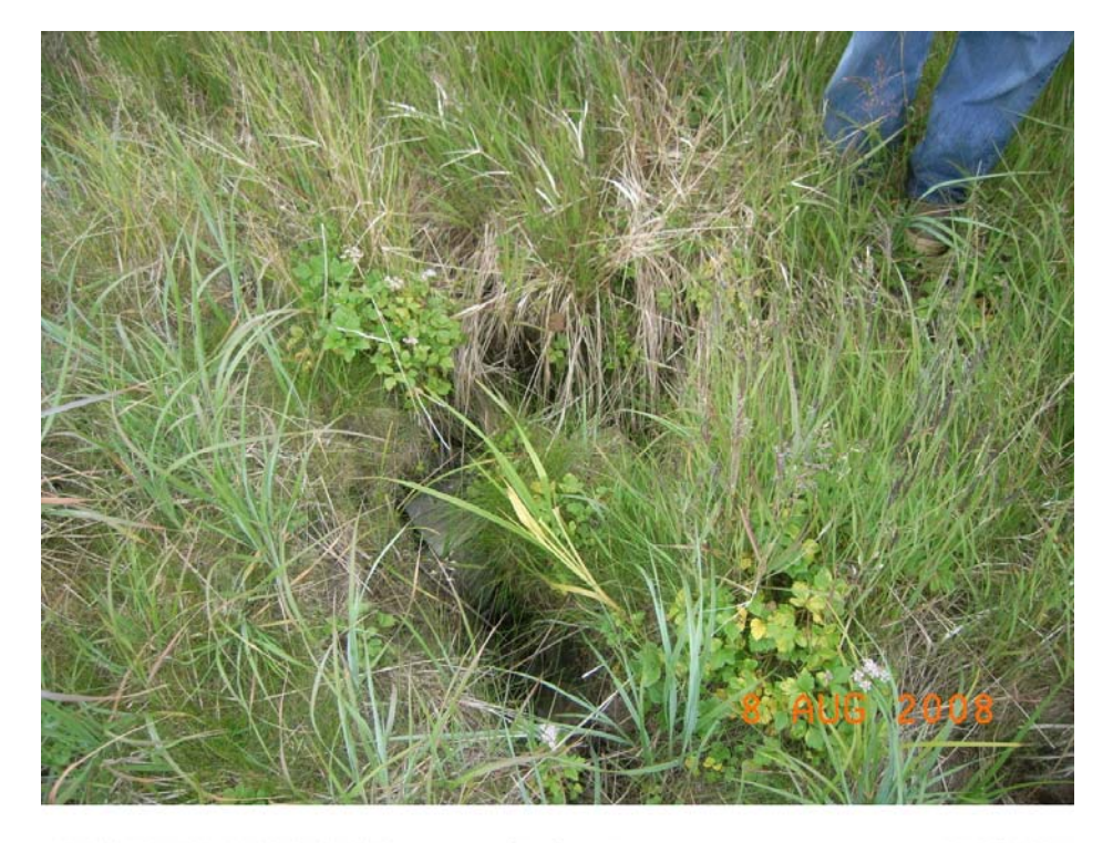
N 60° 09.549' W 164° 16.391' Chefornak Photo 21: A small sinkhole near the top of the bank. RIMG0134